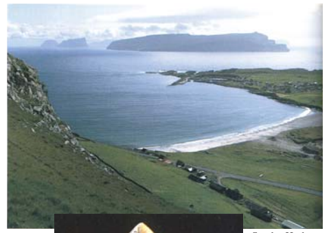
Sandur Harbor, Faroe Islands.