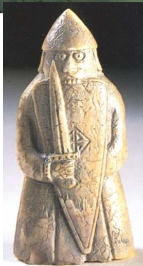
Lewis Chessman: Beserker, courtesy of National Museum of Scotland.