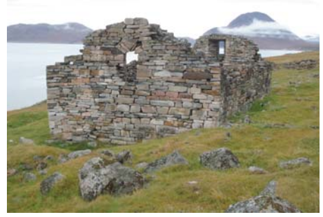
The ruin of Hvalsey church in the Eastern Settlement. (From Ogilvie et al. 2009).

For more information, contact us at: Journal of the North Atlantic, Eagle Hill Foundation, PO Box 9, 59 Eagle Hill Road, Steuben, Maine (ME) 04680-0009, United States. Phone 207-546-2821, FAX 207-546-3042. E-mail: jona@eaglehill.us . www.eaglehill.us/jona